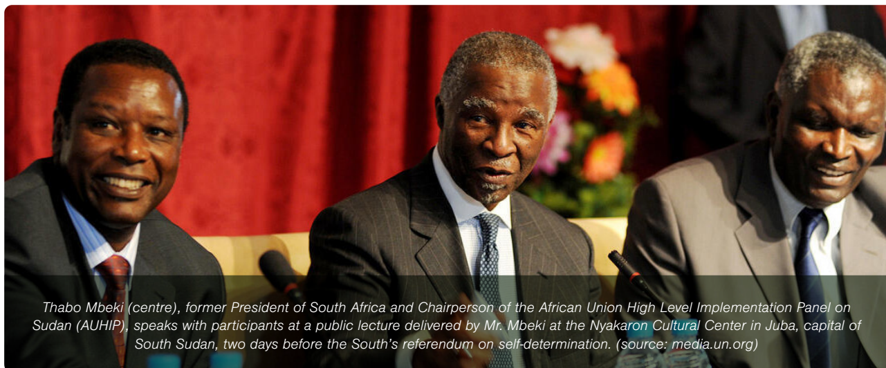
Thabo Mbeki (centre), former President of South Africa and Chairperson of the African Union High Level Implementation Panel on Sudan (AUHIP), speaks with participants at a public lecture delivered by Mr. Mbeki at the Nyakaron Cultural Center in Juba, capital of South Sudan, two days before the South’s referendum on self-determination.

After the Panel was re-mandated as the AUHIP, it continued its research, consultation, and analysis, leading to additional elements to the definition. The second element was that when Sudan split, it would split into two African countries , each characterised by diversity, not into two entities respectively—and antagonistically—defined as ‘Arab’ and ‘African’. This was the central theme of President Mbeki’s lectures in Juba and Khartoum on the eve of the referendum in southern Sudan. 10 Third was that the challenge of secession was the achievement of two viable states . Viability entailed that the two countries were at peace internally and with one another, were able to meet the aspirations of their people for development and welfare and possessed sufficient autonomy to be able to set their own national goals and strategies. This was adopted as the overriding principle for the post-referendum negotiations.