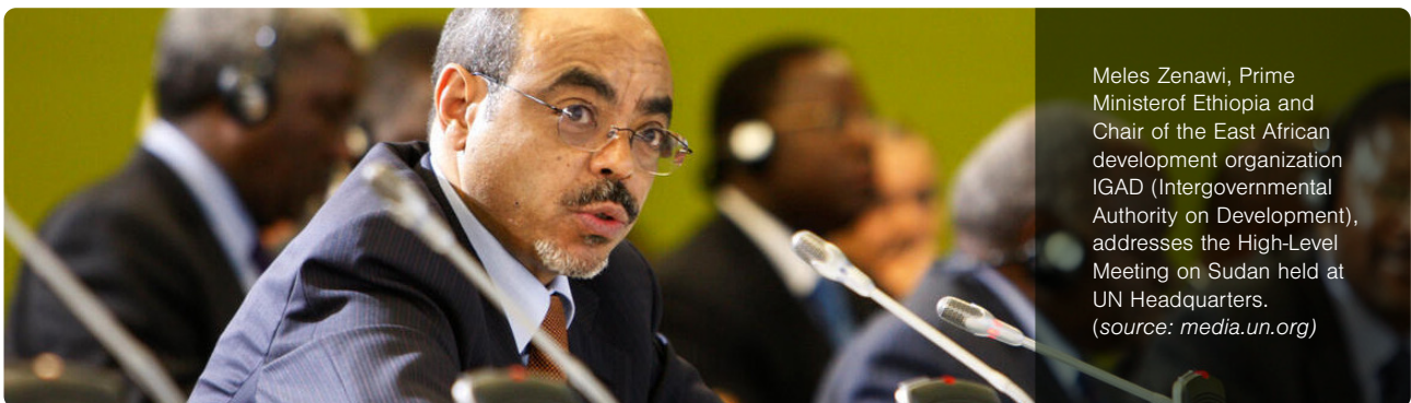
Meles Zenawi, Prime Minister of Ethiopia and Chair of the East African development organization IGAD (Intergovernmental Authority on Development), addresses the High-Level Meeting on Sudan held at UN Headquarters.

The Panel had a close working relationship with IGAD through its Chairperson, the Ethiopian Prime Minister Meles Zenawi, from its inception until his untimely death in August 2012. At every turn, from mandating the AUHIP, through the emergency summit on Abyei and the dispatch of troops for UNISFA, to efforts to resolve the war in the Two Areas and provide unconditional humanitarian assistance to the starving, Prime Minister Meles played an important role with strategic acumen, decisiveness, and discretion. He was trusted by all. Until his very last working day, he remained engaged. His last meeting before leaving Addis Ababa for medical treatment was with a GoS delegation, and one of his final messages from hospital was that there should be no compromise on humanitarian access to the starving in the Two Areas.