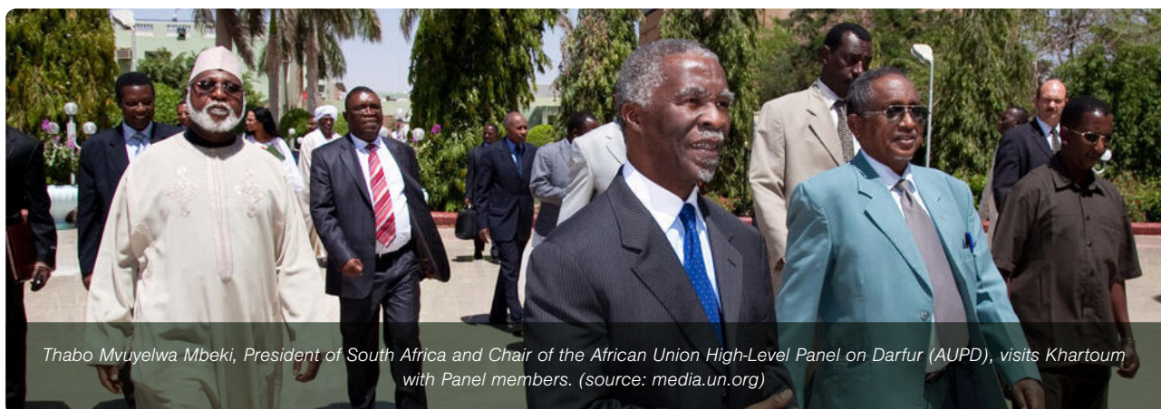
Thabo Mvuyelwa Mbeki, President of South Africa and Chair of the African Union High-Level Panel on Darfur (AUPD), visits Khartoum with Panel members.

Over forty days, the AUPD held the most extensive, frank, and wide-ranging consultations with the people of Darfur and others in Khartoum undertaken by any actor. It ventured to places where the GoS could not go, including areas held by the armed movements and camps for internally displaced persons (IDPs) that were off-limits to the security forces. It spoke with leaders of the nomadic Arab communities, who had been ignored and often denigrated by the international community separately from the GoS. The Panel listened to the views of Darfurians on peace, reconciliation, justice, and Darfur's place in Sudan. They found that neither the government nor the armed movements were offering solutions but that if the people themselves were directly empowered, they could articulate a way ahead.