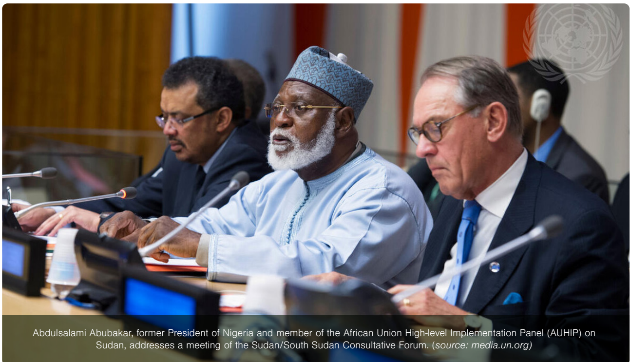
Abdulsalami Abubakar, former President of Nigeria and member of the African Union High-level Implementation Panel (AUHIP) on Sudan, addresses a meeting of the Sudan/South Sudan Consultative Forum.

Unlike the AU PSC, the UNSC did not adopt the AUPD report as UN policy in 2009 and did not at that stage mandate the AUHIP or require it to provide reports. This meant that the Panel was unable to achieve a coordinated or harmonious international approach to implementing its proposals for Darfur. The Sudan Consultative Forum proved useful but did not succeed in aligning policies on Darfur.